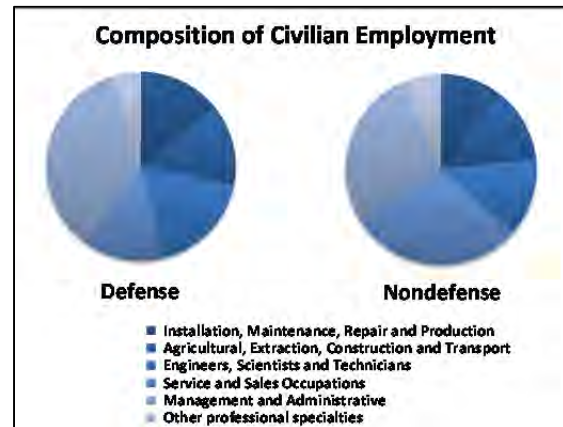
Table 9 details defense-related employment by major occupational category for years 2013–2019. Because of the interest in defense-related employment of engineers and scientists, additional details on employment of these labor categories are provided in Table 10.

The composition of defense-related civilian employment reflects the higher manufacturing intensity of defense purchases, as well as specific employment patterns of the individual industries from which defense purchases are made. Jobs related to defense spending are far less concentrated in sales and service occupations than jobs in the U.S. as a whole.